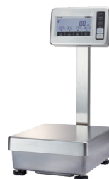
With optional pole kit